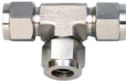
Dimensional Details :