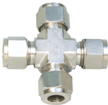
Dimensional Details :